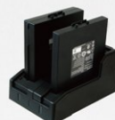
2-bay Battery Charger